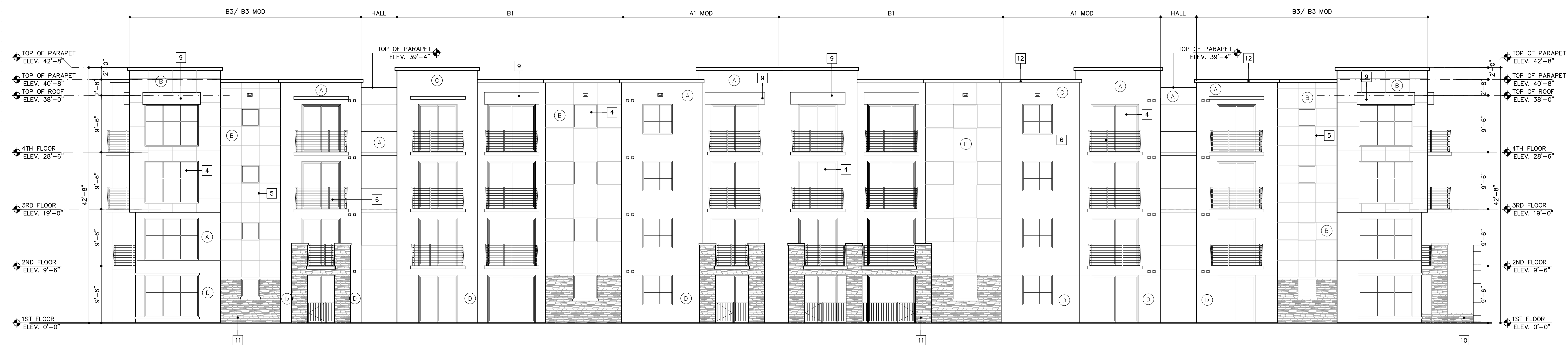
② SOUTH ELEVATION SCALE: 1/8"=1'-0"