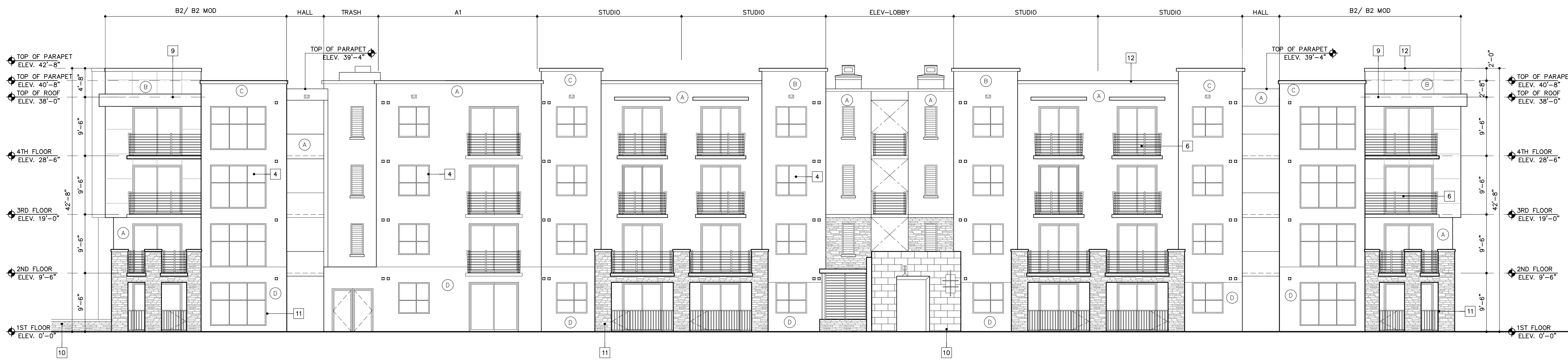
① NORTH ELEVATION SCALE: 1/8"=1'-0"