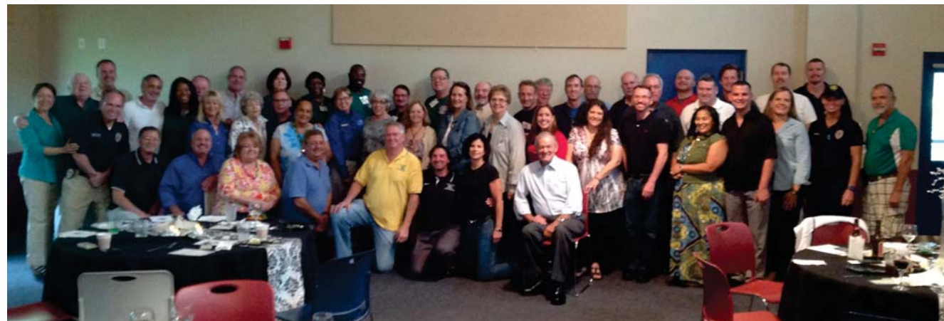
Volunteer Appreciation Event, March 2014

The Wilton Manors Community Affairs Advisory Board (CAAB) has announced the call for nominations for its first-ever Community Spirit Awards . This new effort will recognize one outstanding volunteer and one business in Wilton Manors for outstanding volunteer service.